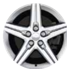
18" Painted Aluminum Wheel (1LT)