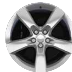
20" Painted Aluminum Wheel with Sterling Silver finish (SS)