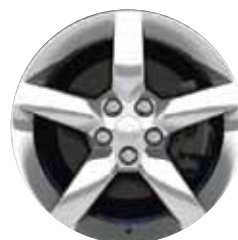
19" Polished Aluminum Wheel (Optional LT wheel)