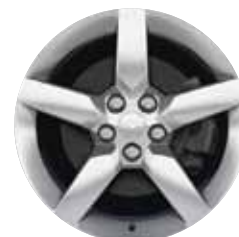
19" Painted Aluminum Wheel (2LT)