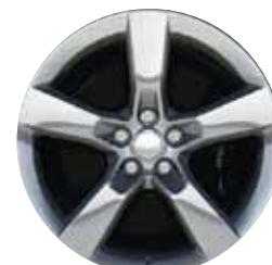
20" Painted Aluminum Wheel with Midnight Silver finish (RS Package)