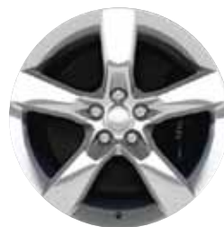
20" Polished Aluminum Wheel (Optional on all SS and LT with RS Package)